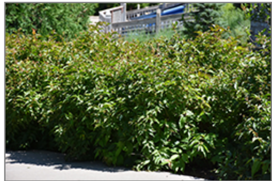
Copper Bush Honeysuckle