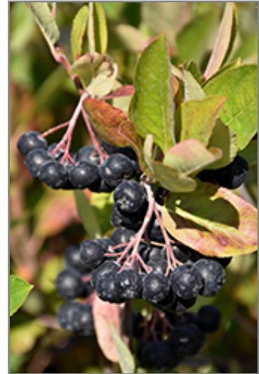
Viking Chokeberry fruit

* This is a 'special order' plant - contact store for details