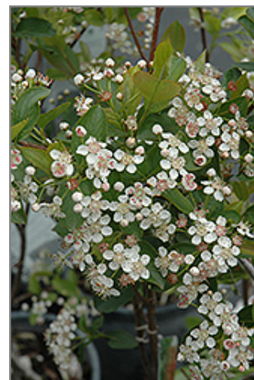
Viking Chokeberry flowers