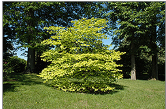
Golden Nugget Flowering Dogwood