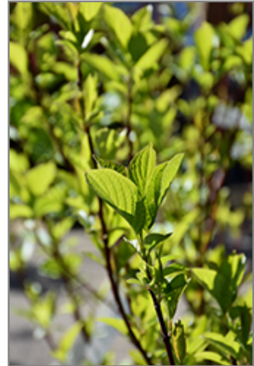
Bailey Red-Twig Dogwood foliage

This shrub does best in full sun to partial shade. It is an amazingly adaptable plant, tolerating both dry conditions and even some standing water. It is not particular as to soil type or pH. It is highly tolerant of urban pollution and will even thrive in inner city environments. This species is native to parts of North America.