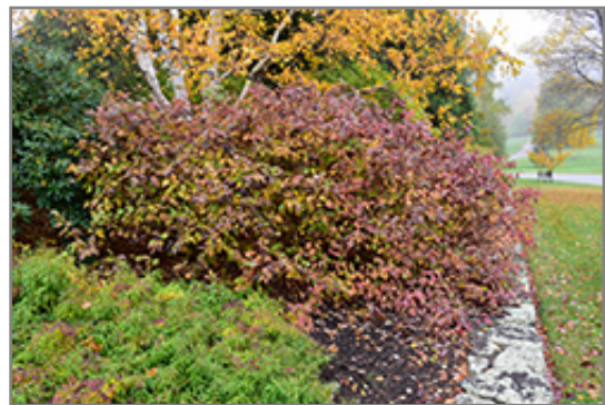
Bailey Red-Twig Dogwood in fall