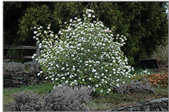
Koreanspice Viburnum in bloom

Koreanspice Viburnum is recommended for the following landscape applications;