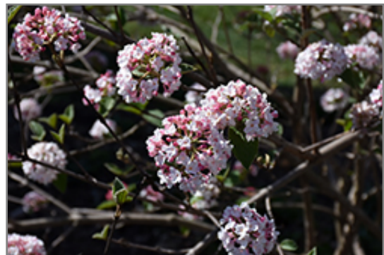
Koreanspice Viburnum flowers