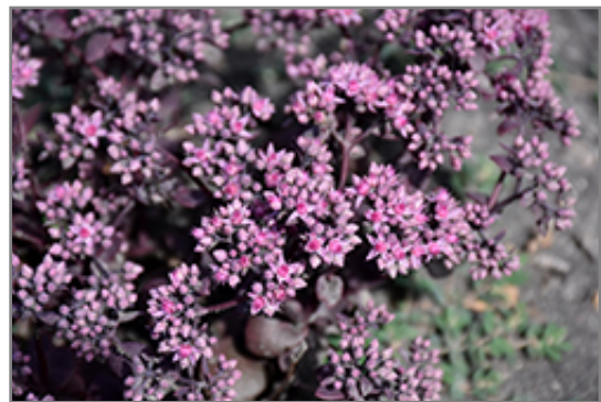
Red Carpet Stonecrop flowers