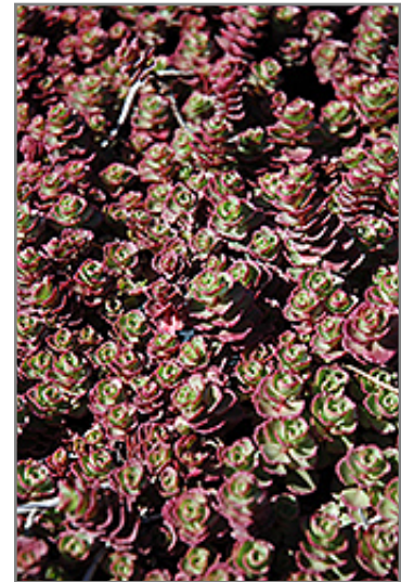
Red Carpet Stonecrop foliage