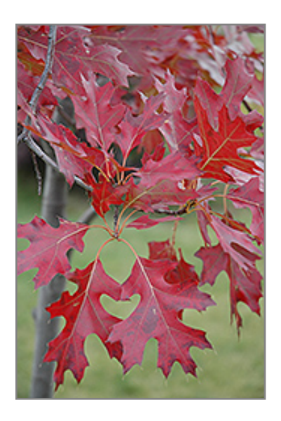
Northern Pin Oak in fall