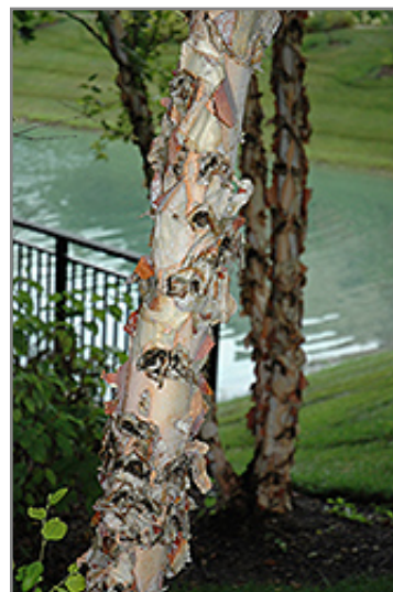
River Birch bark

River Birch will grow to be about 60 feet tall at maturity, with a spread of 45 feet. It has a low canopy with a typical clearance of 3 feet from the ground, and should not be planted underneath power lines. It grows at a fast rate, and under ideal conditions can be expected to live for 70 years or more.