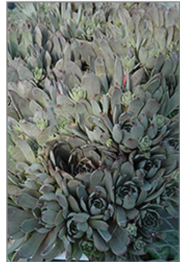
Big Blue Hens And Chicks

Big Blue Hens And Chicks is recommended for the following landscape applications;