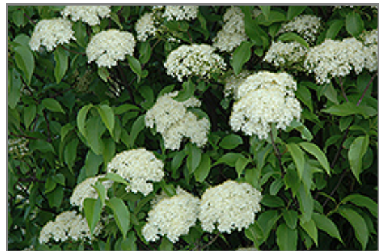
Nannyberry flowers