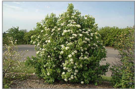
Nannyberry in bloom