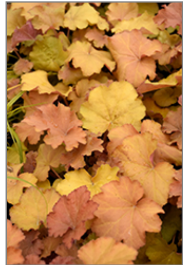
Caramel Coral Bells foliage

Caramel Coral Bells is recommended for the following landscape applications;