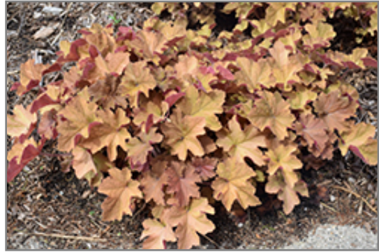
Caramel Coral Bells

Caramel Coral Bells will grow to be about 10 inches tall at maturity extending to 18 inches tall with the flowers, with a spread of 18 inches. When grown in masses or used as a bedding plant, individual plants should be spaced approximately 15 inches apart. Its foliage tends to remain low and dense right to the ground. It grows at a medium rate, and under ideal conditions can be expected to live for approximately 10 years. As an evergreen perennial, this plant will typically keep its form and foliage year-round.