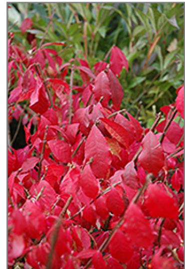
Burning Bush (tree form) in fall