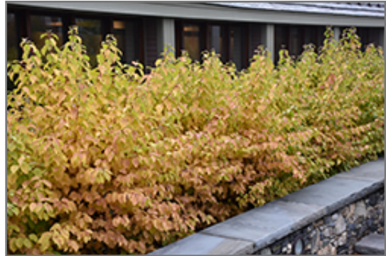
Midwinter Fire Dogwood in fall

Midwinter Fire Dogwood is recommended for the following landscape applications;