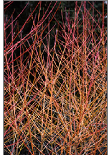
Midwinter Fire Dogwood stems

This shrub does best in full sun to partial shade. It prefers to grow in average to moist conditions, and shouldn't be allowed to dry out. It is not particular as to soil type or pH. It is highly tolerant of urban pollution and will even thrive in inner city environments. This is a selected variety of a species not originally from North America.