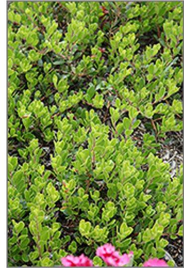
Bearberry foliage

This shrub does best in full sun to partial shade. It is very adaptable to both dry and moist growing conditions, but will not tolerate any standing water. It is considered to be drought-tolerant, and thus makes an ideal choice for a low-water garden or xeriscape application. It is very fussy about its soil conditions and must have sandy, acidic soils to ensure success, and is subject to chlorosis (yellowing) of the leaves in alkaline soils, and is able to handle environmental salt. It is somewhat tolerant of urban pollution. This species is native to parts of North America.