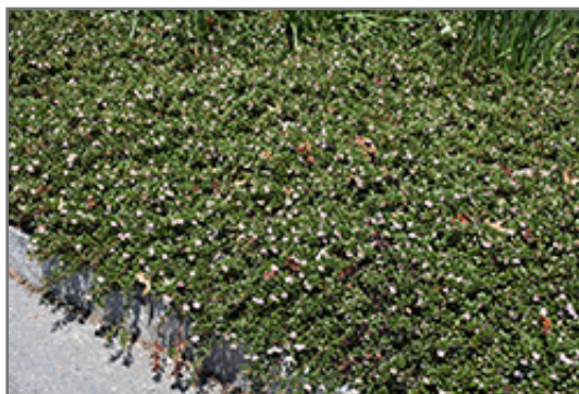
Bearberry in bloom