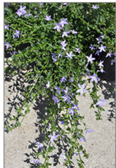
Blue Waterfall Serbian Bellflower in bloom