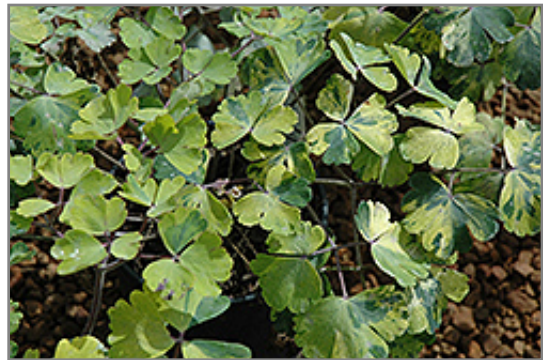
Leprechaun Gold Columbine foliage