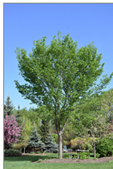
Brandon Elm