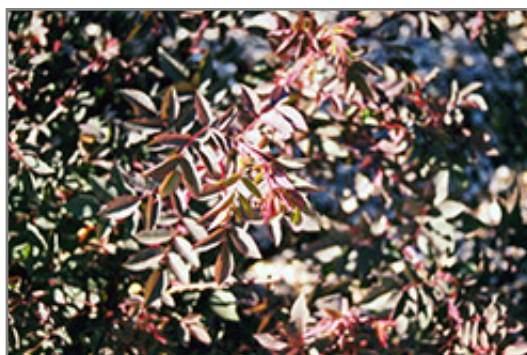
Red Leaf Rose foliage