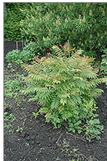
Sem False Spirea