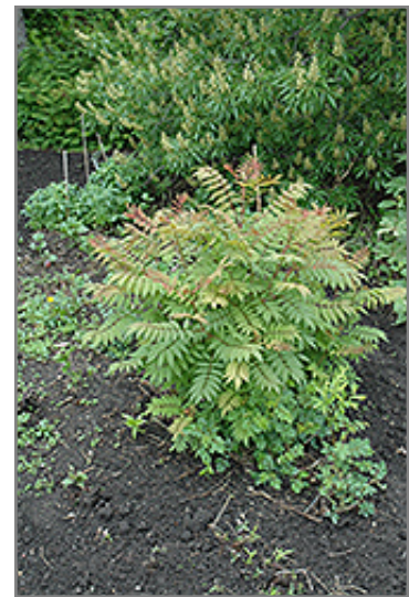
Sem False Spirea