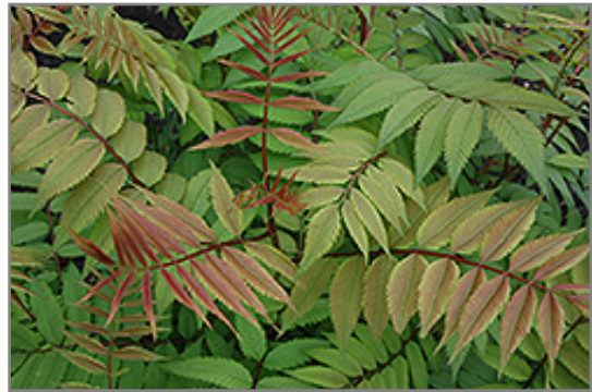
Sem False Spirea foliage

Sem False Spirea is recommended for the following landscape applications;