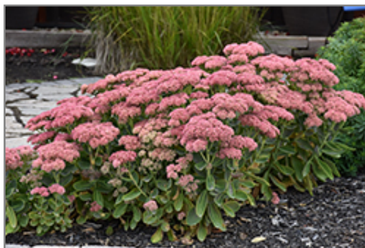
Autumn Fire Stonecrop in bloom