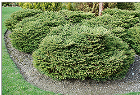
Creeping Norway Spruce