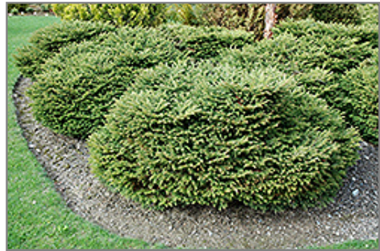
Creeping Norway Spruce