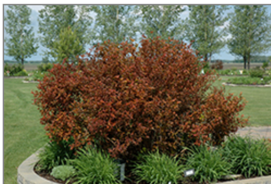
Coppertina Ninebark