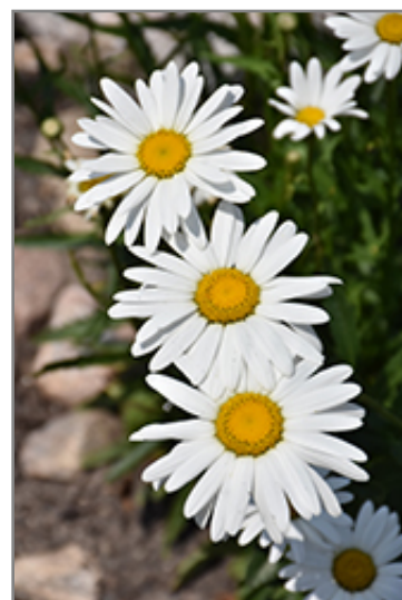
Silver Princess Shasta Daisy flowers