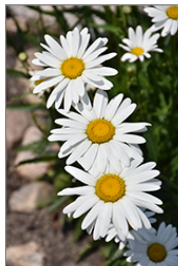
Silver Princess Shasta Daisy flowers