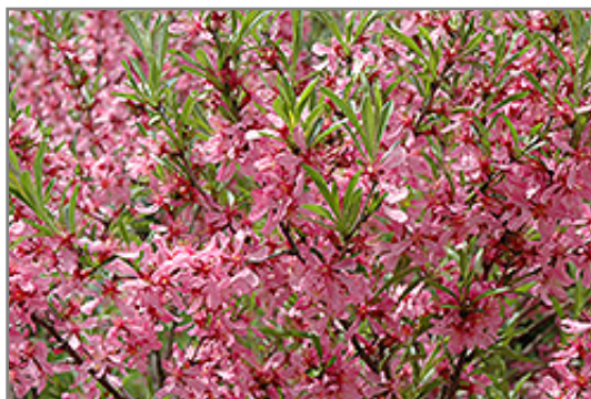
Russian Almond flowers