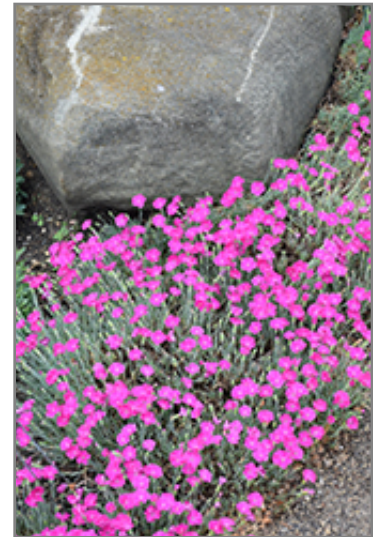
Firewitch Pinks in bloom

Firewitch Pinks is a fine choice for the garden, but it is also a good selection for planting in outdoor pots and containers. It is often used as a 'filler' in the 'spiller-thriller-filler' container combination, providing a mass of flowers and foliage against which the thriller plants stand out. Note that when growing plants in outdoor containers and baskets, they may require more frequent waterings than they would in the yard or garden. Be aware that in our climate, most plants cannot be expected to survive the winter if left in containers outdoors, and this plant is no exception. Contact our experts for more information on how to protect it over the winter months.