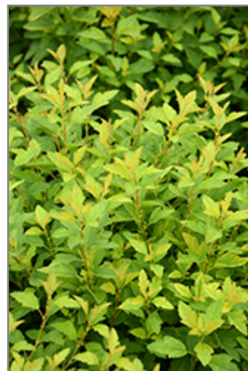
Raspberry Lemonade Ninebark foliage