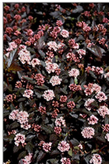
Little Joker Ninebark flowers