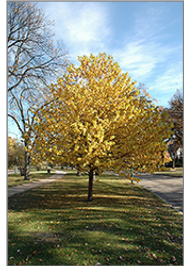
Amur Cherry in fall

This tree should only be grown in full sunlight. It does best in average to evenly moist conditions, but will not tolerate standing water. It is not particular as to soil type or pH. It is somewhat tolerant of urban pollution. This species is not originally from North America.