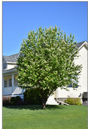
Amur Cherry