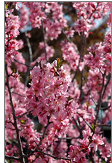
Muckle Plum (tree form) flowers