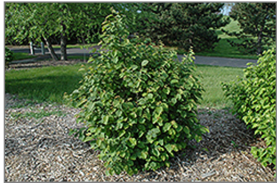
Beaked Hazelnut

This plant is typically grown in a designated edibles garden. It performs well in both full sun and full shade. It is very adaptable to both dry and moist locations, and should do just fine under average home landscape conditions. It is considered to be drought-tolerant, and thus makes an ideal choice for xeriscaping or the moisture-conserving landscape. It is not particular as to soil type or pH. It is highly tolerant of urban pollution and will even thrive in inner city environments. This species is native to parts of North America.