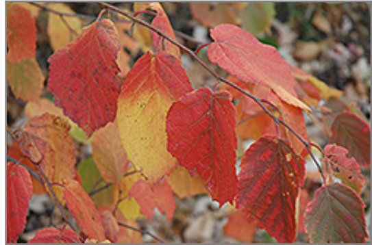
Beaked Hazelnut in fall