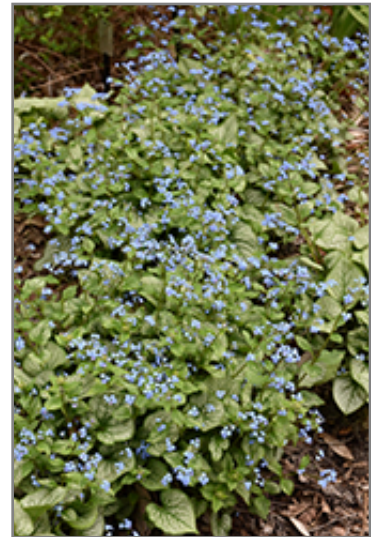
Jack Frost Bugloss in bloom

Jack Frost Bugloss is a fine choice for the garden, but it is also a good selection for planting in outdoor pots and containers. It is often used as a 'filler' in the 'spiller-thriller-filler' container combination, providing a mass of flowers and foliage against which the thriller plants stand out. Note that when growing plants in outdoor containers and baskets, they may require more frequent waterings than they would in the yard or garden. Be aware that in our climate, most plants cannot be expected to survive the winter if left in containers outdoors, and this plant is no exception. Contact our experts for more information on how to protect it over the winter months.