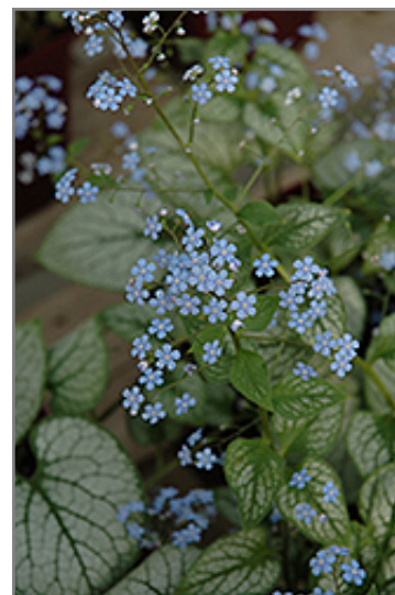
Jack Frost Bugloss flowers