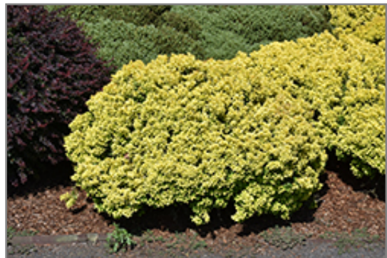
Golden Nugget Japanese Barberry