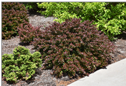
Concorde Japanese Barberry

Concorde Japanese Barberry is recommended for the following landscape applications;