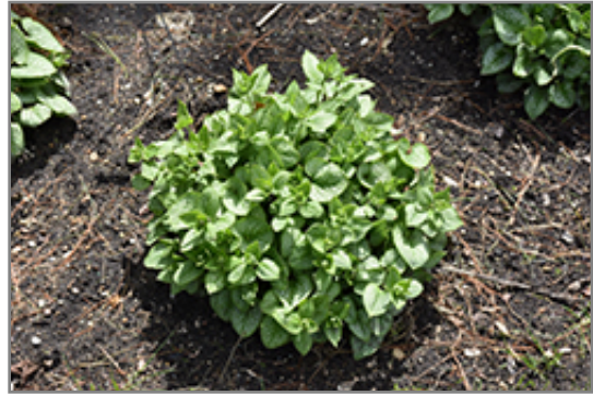
Jack of Diamonds Bugloss

Jack of Diamonds Bugloss will grow to be about 14 inches tall at maturity, with a spread of 30 inches. When grown in masses or used as a bedding plant, individual plants should be spaced approximately 28 inches apart. It grows at a medium rate, and under ideal conditions can be expected to live for approximately 10 years. As an herbaceous perennial, this plant will usually die back to the crown each winter, and will regrow from the base each spring. Be careful not to disturb the crown in late winter when it may not be readily seen!