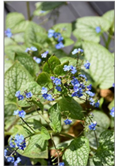
Jack of Diamonds Bugloss flowers