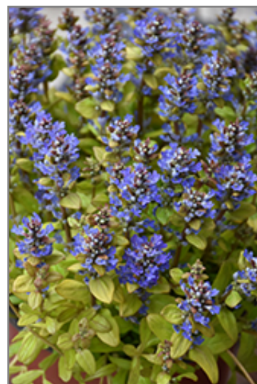
Feathered Friends Fancy Finch Bugleweed flowers

Feathered Friends Fancy Finch Bugleweed is recommended for the following landscape applications;