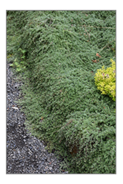
Wooly Thyme