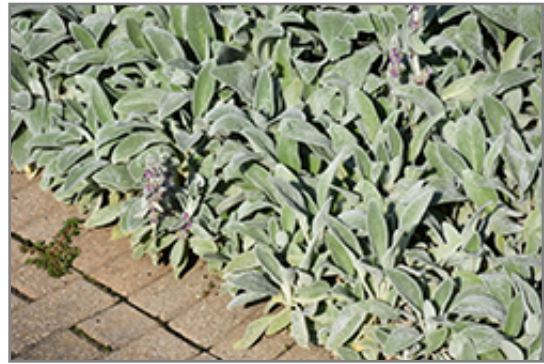
Lamb's Ears

Lamb's Ears will grow to be about 12 inches tall at maturity extending to 24 inches tall with the flowers, with a spread of 18 inches. When grown in masses or used as a bedding plant, individual plants should be spaced approximately 15 inches apart. Its foliage tends to remain dense right to the ground, not requiring facer plants in front. It grows at a fast rate, and under ideal conditions can be expected to live for approximately 10 years. As an herbaceous perennial, this plant will usually die back to the crown each winter, and will regrow from the base each spring. Be careful not to disturb the crown in late winter when it may not be readily seen!