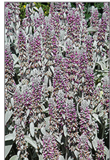
Lamb's Ears flowers