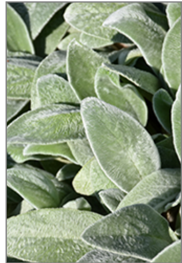
Lamb's Ears foliage

Lamb's Ears is recommended for the following landscape applications;