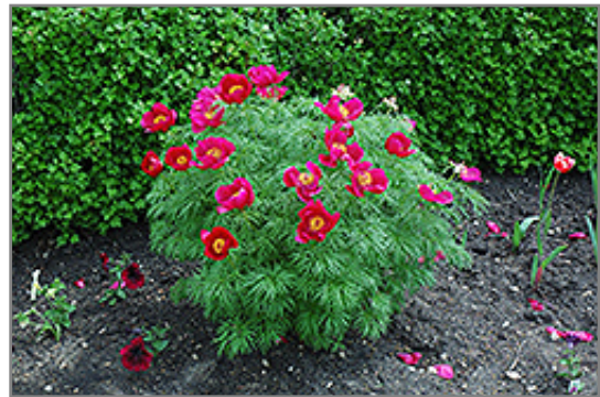
Fernleaf Peony in bloom