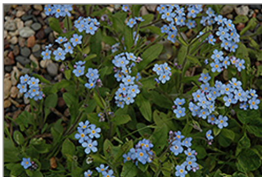
Forget-Me-Not flowers