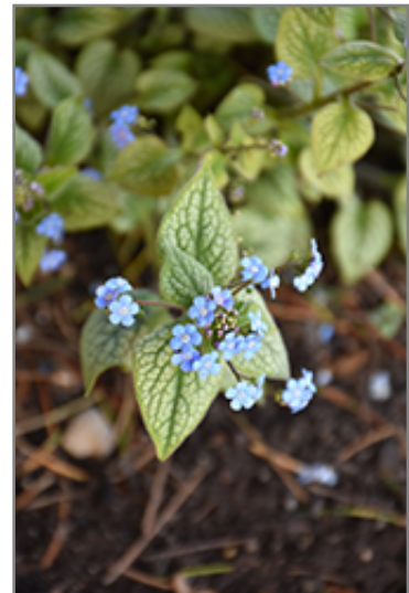
Alchemy Silver Bugloss flowers