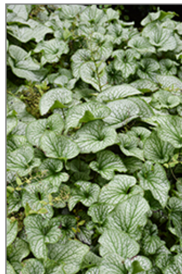
Alchemy Pewter Bugloss foliage