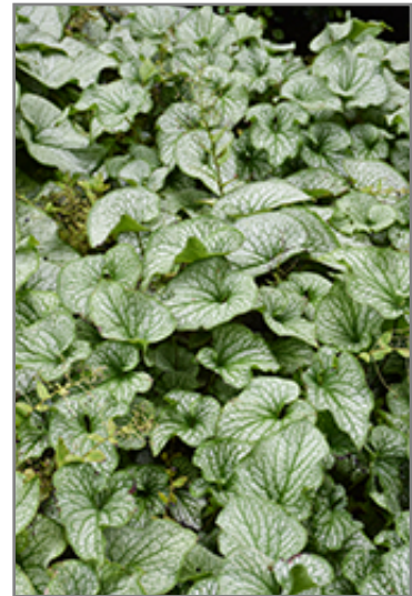
Alchemy Pewter Bugloss foliage