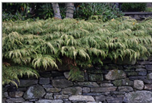
Russian Cypress