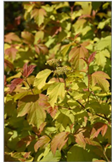
Oh Canada Cranberry Bush foliage