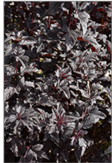
Royal Jubilee Ninebark foliage

This shrub does best in full sun to partial shade. It is very adaptable to both dry and moist locations, and should do just fine under average home landscape conditions. It is not particular as to soil type or pH. It is highly tolerant of urban pollution and will even thrive in inner city environments. This is a selection of a native North American species.