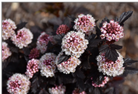
Royal Jubilee Ninebark flowers

This shrub will require occasional maintenance and upkeep, and can be pruned at anytime. Deer don't particularly care for this plant and will usually leave it alone in favor of tastier treats. It has no significant negative characteristics.