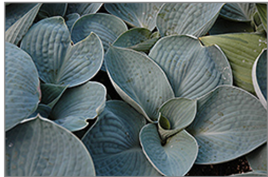
Love Pat Hosta foliage