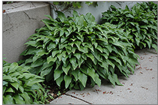
Invincible Hosta