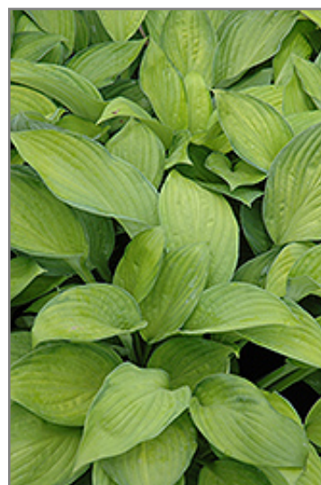
Gold Standard Hosta foliage