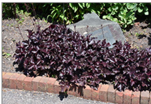
Obsidian Coral Bells