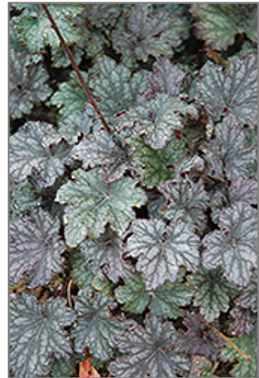
Frosted Violet Coral Bells foliage

Frosted Violet Coral Bells is recommended for the following landscape applications;