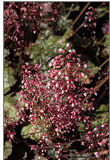
Frosted Violet Coral Bells flowers