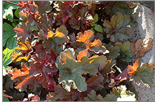
Chocolate Ruffles Coral Bells foliage

Chocolate Ruffles Coral Bells will grow to be about 10 inches tall at maturity extending to 24 inches tall with the flowers, with a spread of 12 inches. When grown in masses or used as a bedding plant, individual plants should be spaced approximately 10 inches apart. Its foliage tends to remain low and dense right to the ground. It grows at a medium rate, and under ideal conditions can be expected to live for approximately 10 years. As an evergreen perennial, this plant will typically keep its form and foliage year-round.