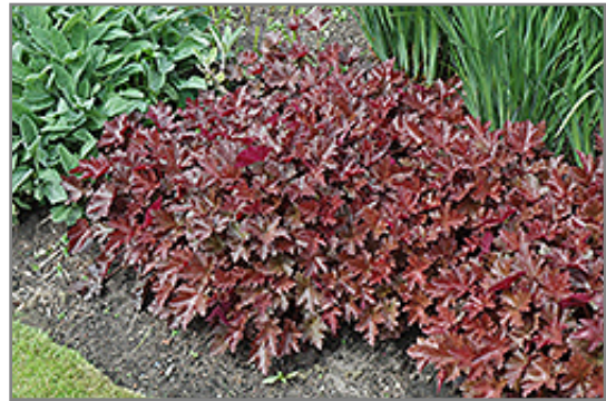
Chocolate Ruffles Coral Bells

Chocolate Ruffles Coral Bells is recommended for the following landscape applications;